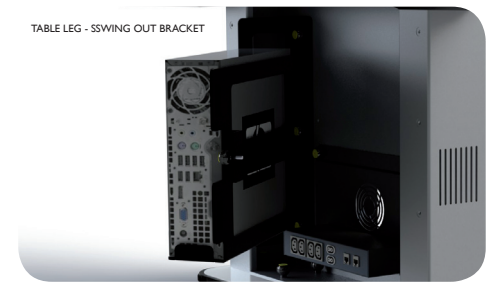
TABLE LEG - SSWING OUT BRACKET