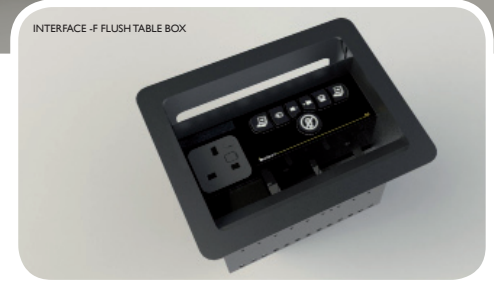
INTERFACE - F FLUSH TABLE BOX

The tablefor7 also comes complete with our interface-f that provides two laptop connections, microphone and semi-automated control of the adjoining Connect system.