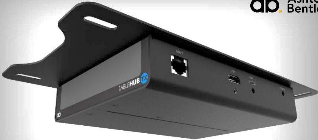
Connection Plate 1